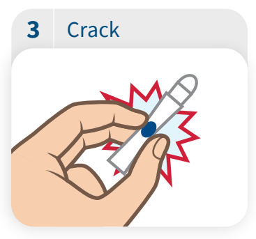
Press the blue dot